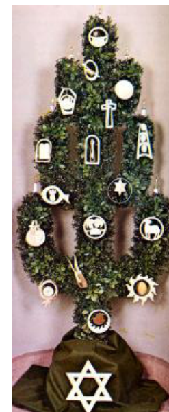
Examples of a finished Jesse Tree