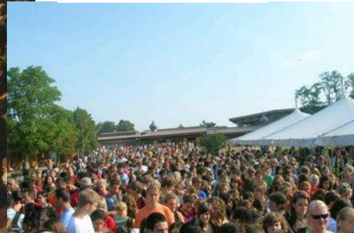
Just the odd one or two people!