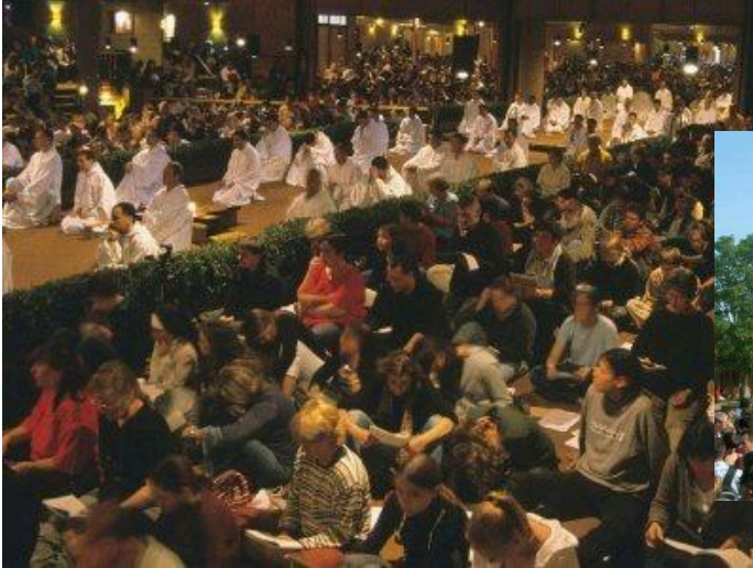
The community at prayer